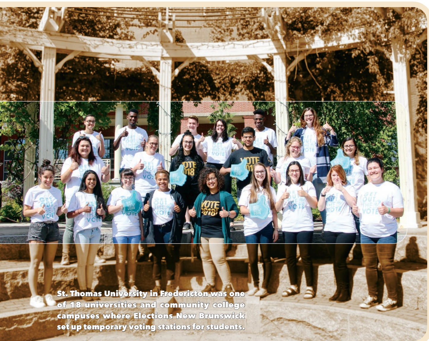
St. Thomas University in Fredericton was one of 18 universities and community college campuses where Elections New Brunswick set up temporary voting stations for students.