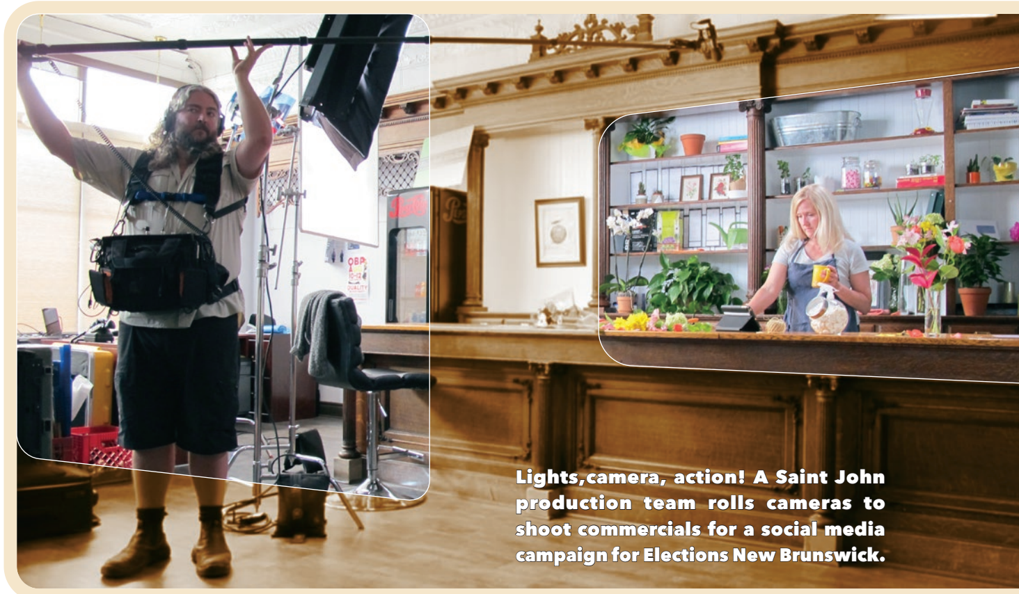
Lights, camera, action! A Saint John production team rolls cameras to shoot commercials for a social media campaign for Elections New Brunswick.

An emerging issue facing election management bodies across the country is the increased use of social media platforms to deliver election campaigns. With that comes a debate on what role, if any, election management bodies should play in moderating the risk of misinformation being posted during an election.