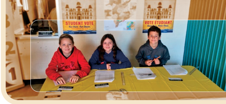
Students at a New Brunswick middle school take part in the national Student Vote program.